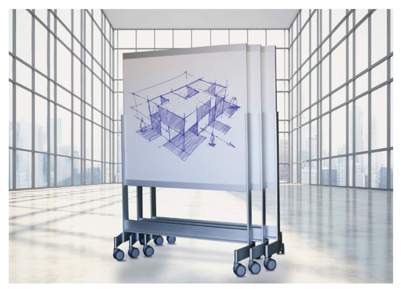
VIP Series magnetic two-sided Mobile Markerboards in porcelain steel with heavy duty frame and casters.