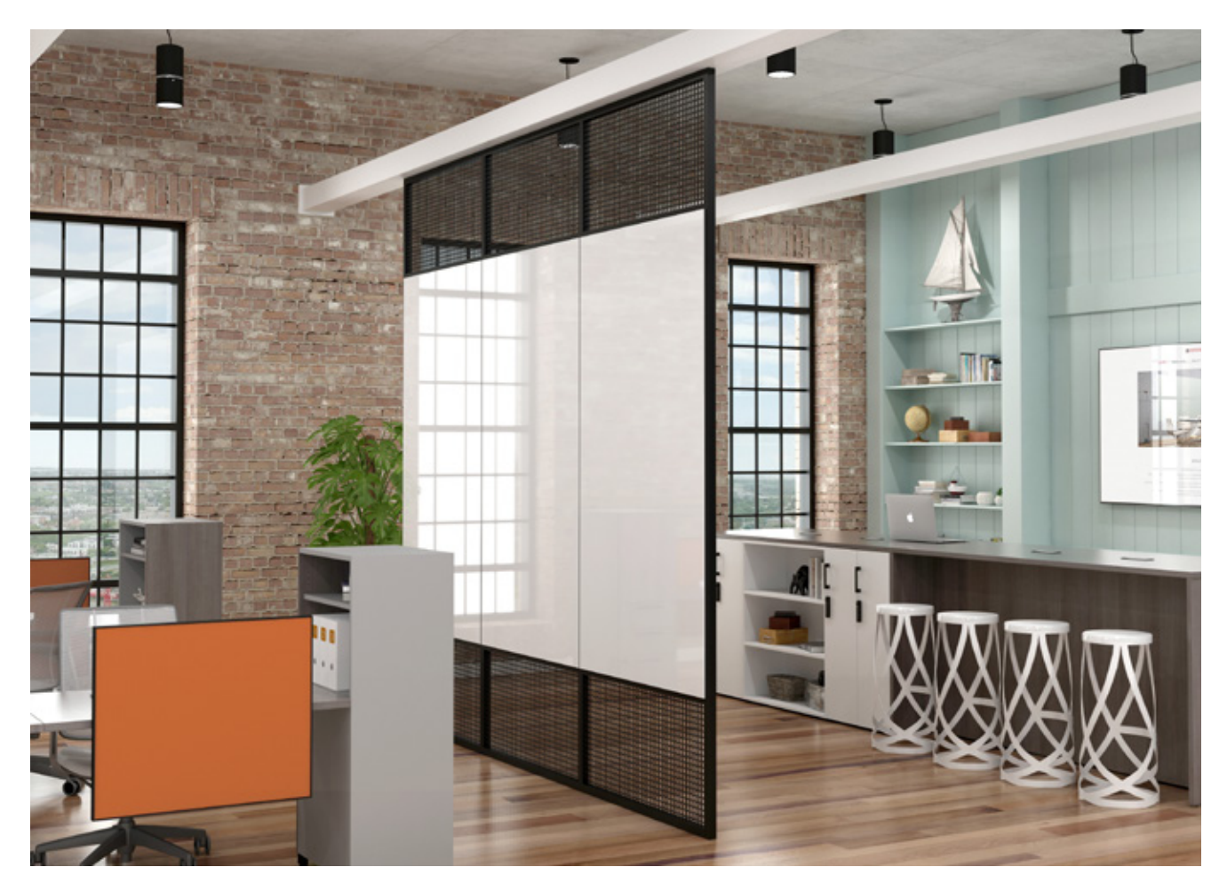
Intersection Mesh—a divider system with porcelain boards, metal mesh and powder-coated frame