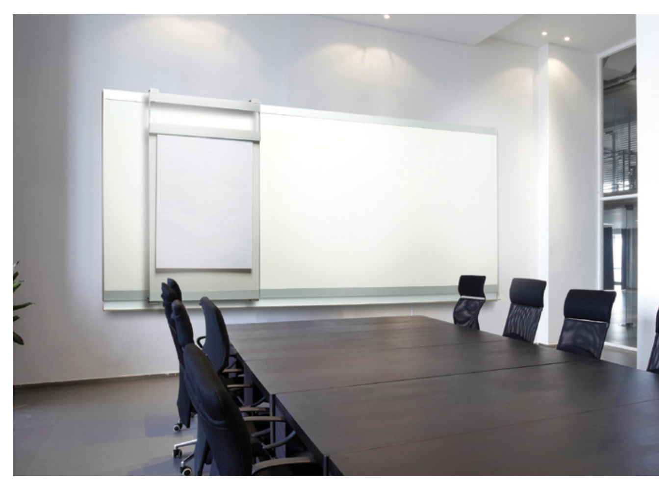
VIP Series markerboard with component boards. The original multi-level porcelain steel markerboard system.