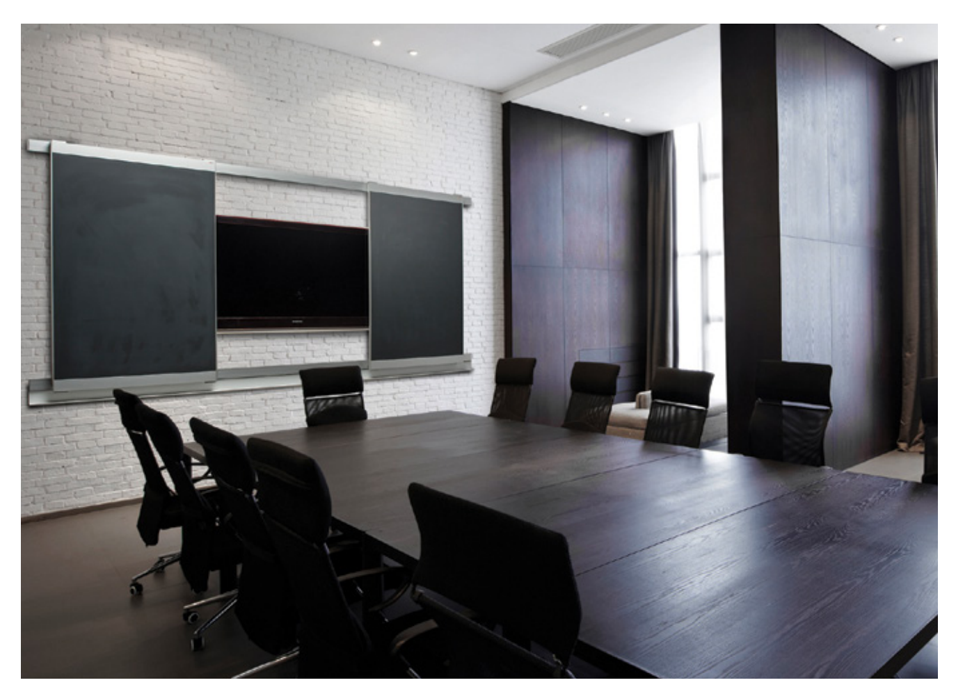
VIP Series Media Wall—Component Boards in porcelain and fabric create elegant presentation walls for both Digital and Analog tools.