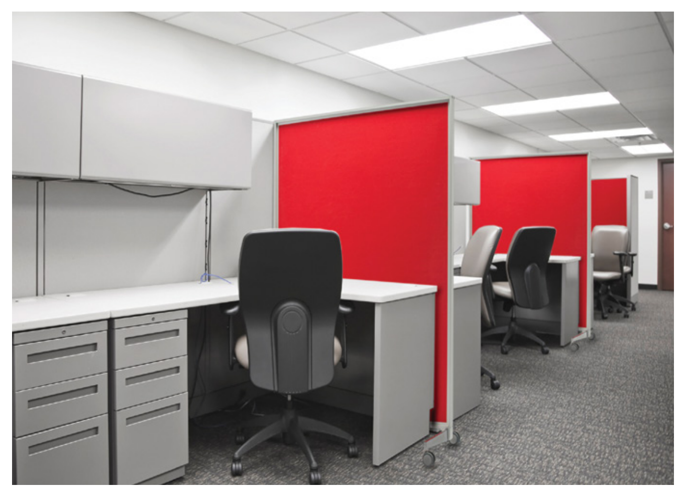
elements Series Mobile Board Dividers Tri-Leg in fabric or porcelain.