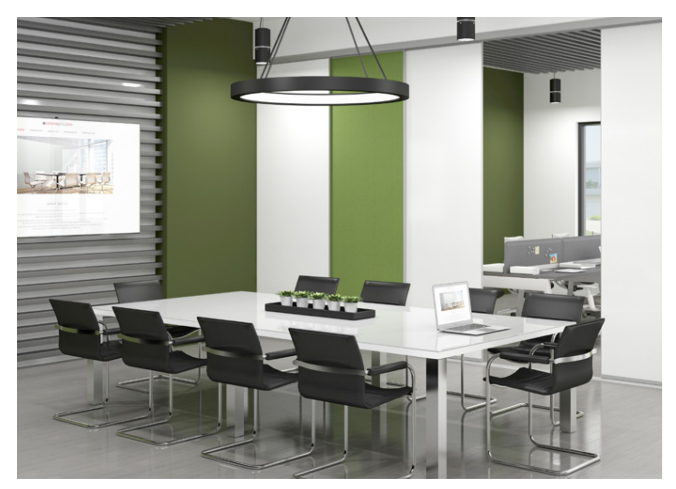
VIP+ Series Sliding Panel System, floor-to-ceiling porcelain markerboards/fabric.