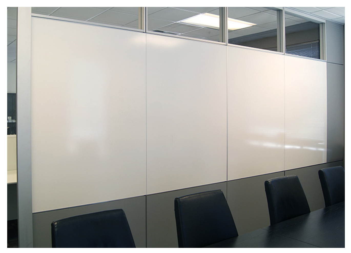
Inserts for third-party modular walls, in forever-warrantied porcelain steel markerboards or chalkboards.